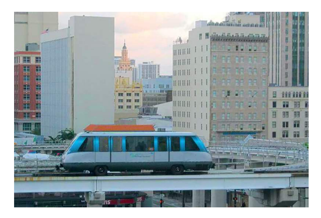
Fig. 3.1 for Question 3